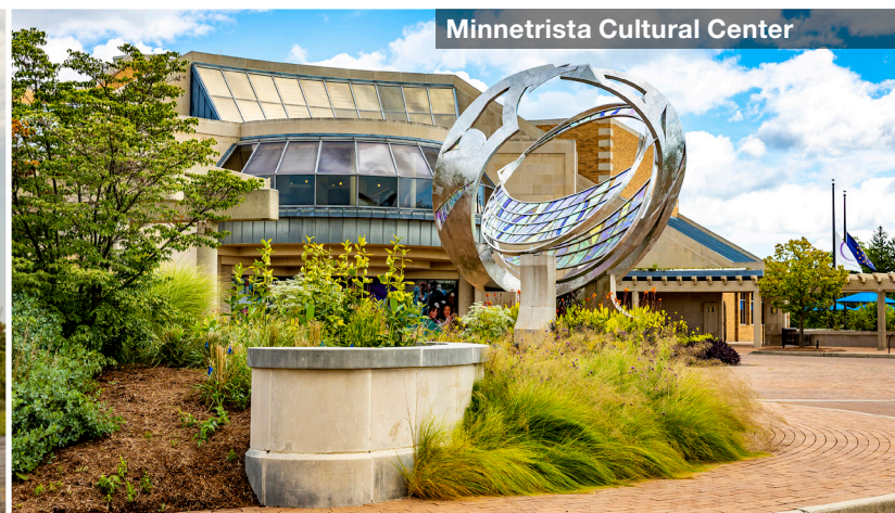
Minnetrista Cultural Center