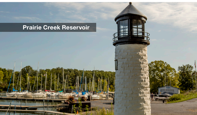
Prairie Creek Reservoir